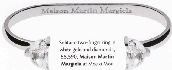
Solitaire two-finger ring in white gold and diamonds, £5,590, Maison Martin Margiela at Mouki Mou