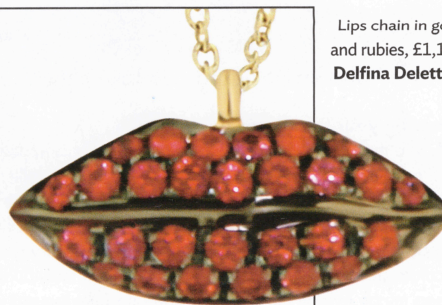
Lips chain in gold and rubies, £1,100, Delfina Delettrez