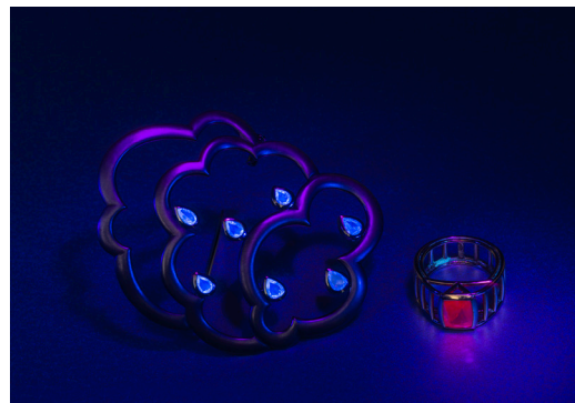
Left: Large Cupcake Ring, 18k Rose and White Gold set with pink Opal and pink Spinel baguettes; Berry Ring, 18k Rose Gold set with pink Sapphire beads; Decorated Gugelhupf Ring, 18k Rose Gold set with Rubies. Right: Cloud Brooch, 18k White Gold set with Daimonds; Valence Plus Ring, 18k Rose Gold set with a Pink Sapphire.