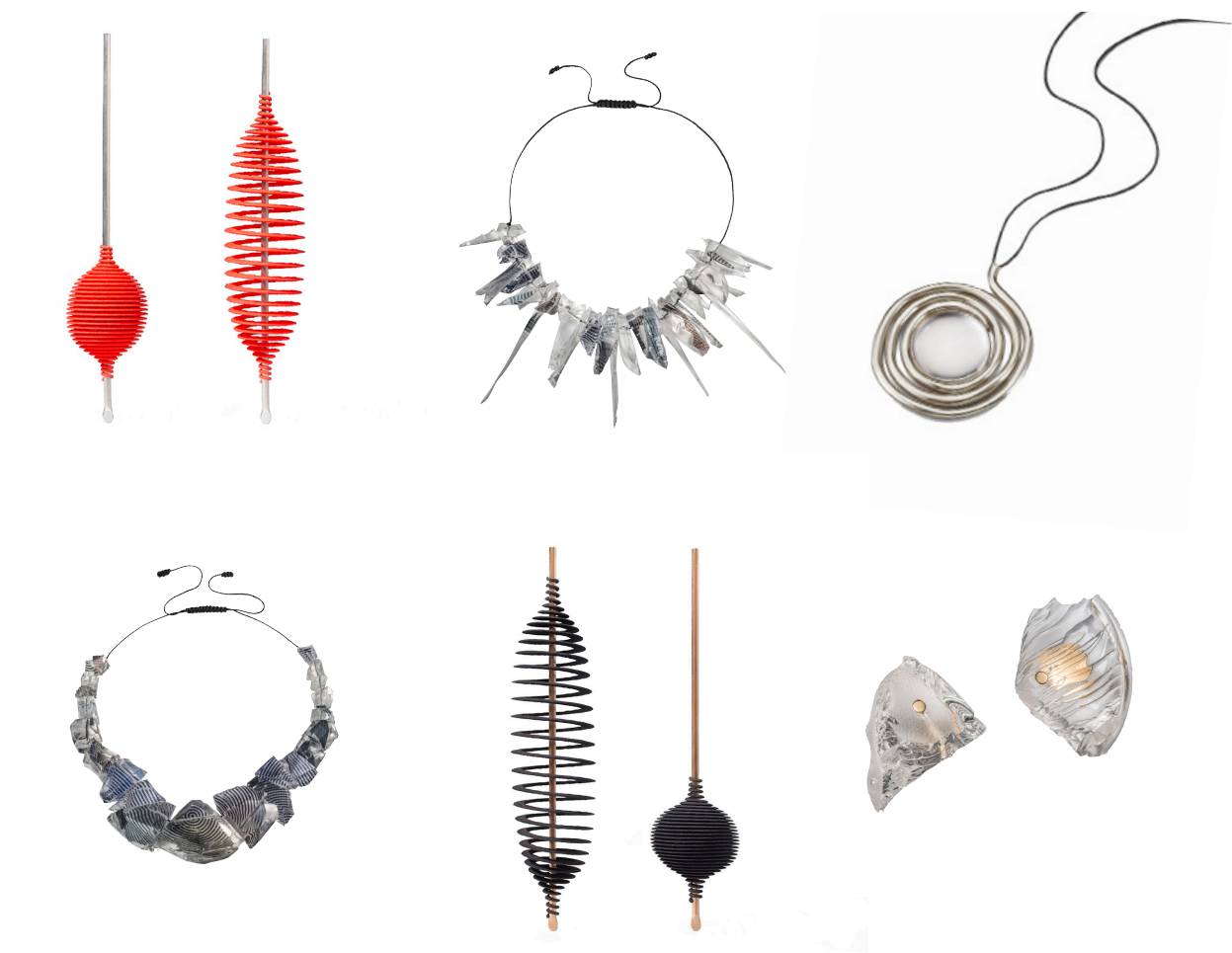
Top Left: Hot Ingo , 2015, Earrings, silver & red laser sintered polyamide, edition of 100; Rocks N.IV , 2015, Necklace, silk and silicon, 20.6 x 9.0 x 1.7 cm approx, unique; Naja, Free Hand , 2015, Necklace, silver with quartz lens, diameter: 6.5 cm approx, series of 25

Naja , the final series, is a magnifying glass pendant made of a solid quartz lens, surrounded by a serpentine coil of silver or vermeil. The work is named after the distinctive "be-spectacled" markings on the hood of a Naja cobra. Not only a beautiful object, artwork and jewel, with a typically Aradian twist it can also be used to decipher a cocktail menu.