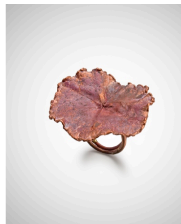
Claude Lalanne, Bague en Fleur