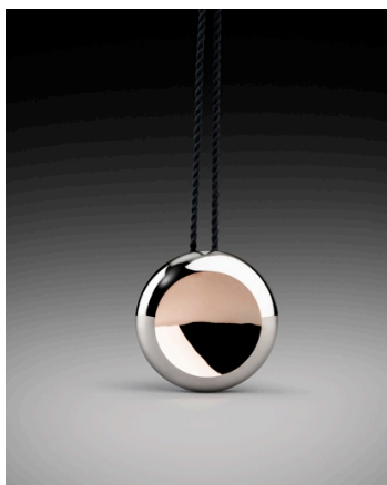
Anish Kapoor, Water Pendant