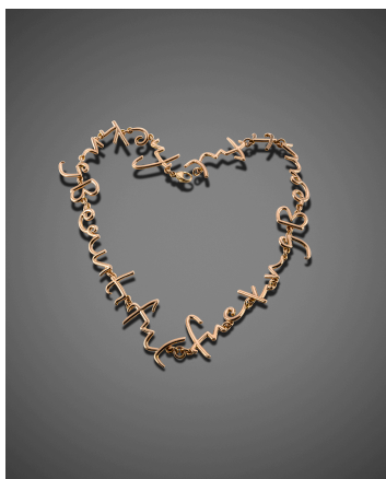
Tim Noble and Sue Webster Fucking Beautiful Necklace