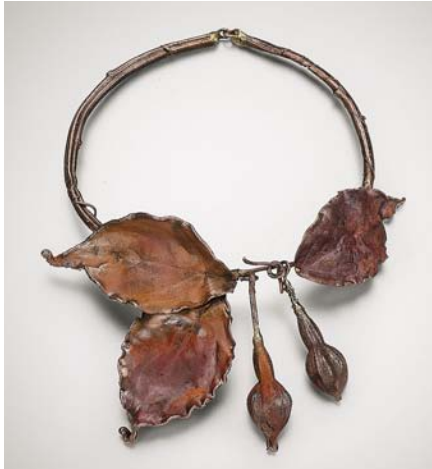
CLAUDE LALANNE UNTITLED NECKLACE unique galvanised copper Executed in 2013.