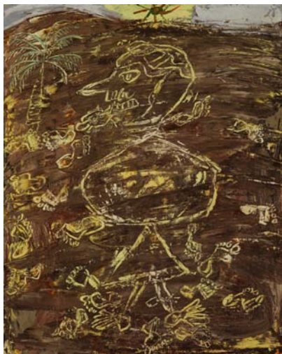
JEAN DUBUFFET NOMADE AUX TRACES DE PAS DANS LE SABLE signed, dated 48 and inscribed à Edmond Bomsel oil on canvas 36¼ by 28⅞ in. 92.1 by 73.3 cm.

Jean Dubuffet: A Fine Line will celebrate work by the father of Art Brut, Jean Dubuffet, and will explore the boundary bridged by the artist between outsider and contemporary art. The exhibition follows the path of his emblematic line from the beginning of his career to the end of his life, showcasing pieces from each period in the artist's oeuvre. Nomade aux traces de pas dans le sable from 1948 leads the exhibition and is completely fresh to the market. The present work is one of the best canvases from the Arab series of which there are only about 10 major works. This piece is the first major work from the series to come to market since Sotheby's sold Arabe au fusil in 2009. Preceding that, there has been nothing since the early 1990's when Sotheby's set the record with Ils tiennent conseil . A further highlight is Le Pirate , a beautiful hourloupe sculpture whose desirable and unusual strong facial features and figurative qualities exemplify one of the most important moments in the artist's career. Prices range from $50,000 to $3 million.