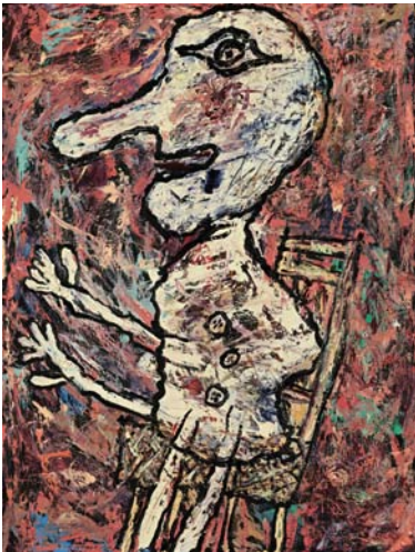
JEAN DUBUFFET NEZ LONG ET CHAISE signed and dated 61; signed, titled and dated Sept. 61 on the reverse oil on canvas 45¾ by 35 in. 116.2 by 88.9 cm.