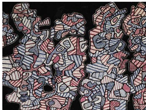
JEAN DUBUFFET LE TRAIN DES VACANTS signed, titled, and dated Octobre 65 on the reverse oil on canvas 38¼ by 51⅞ in. 97.2 by 130.5 cm.