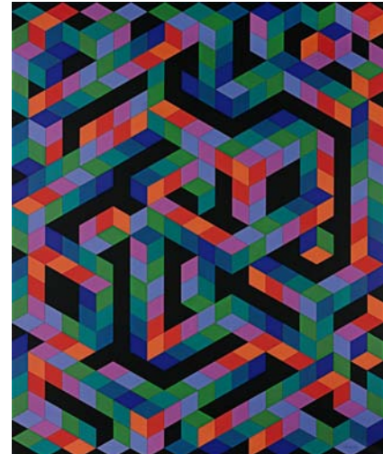
VICTOR VASARELY DAYMON signed; signed, titled and dated 1982 on the reverse acrylic on canvas 112¾ by 93¾ in. 286.4 by 238.1 cm.

The sale page can be found here: http://www.sothebys.com/en/auctions/2013/vasarely-n09173.html