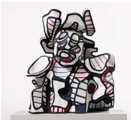
JEAN DUBUFFET LE PIRATE signed with the artist's initials and dated 75 on the bottom edge polyurethane paint on polyester 43 by 37½ by 24 in. 109.2 by 95.3 by 61 cm.