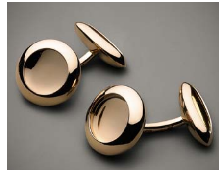
ANISH KAPOOR WATER CUFFLINKS, FORM I edition of 100 plus 20 artist's proofs 18 carat rose gold polished Executed in 2013.