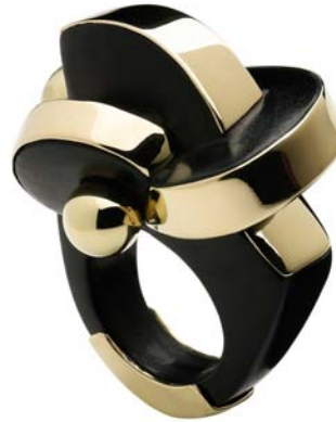
SOPHIA VARI LES PLÉIADES III RING edition of 6 plus 2 artist's proofs 18 carat yellow gold and ebony Executed in 2011.

The sale page can be found here: http://www.sothebys.com/en/auctions/2013/artist-jewellery-louisa-guinness-n09175.html